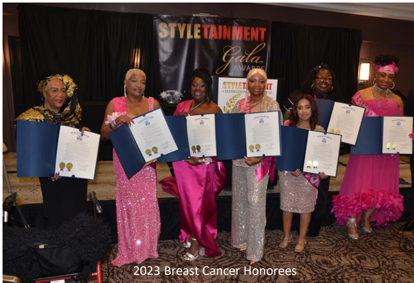
2023 Breast Cancer Honorees