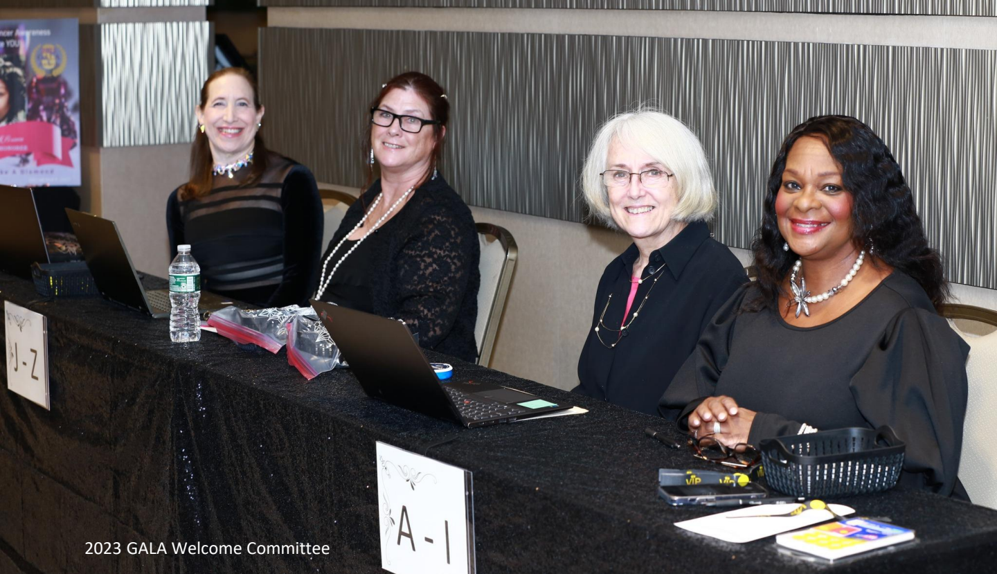
2023 GALA Welcome Committee