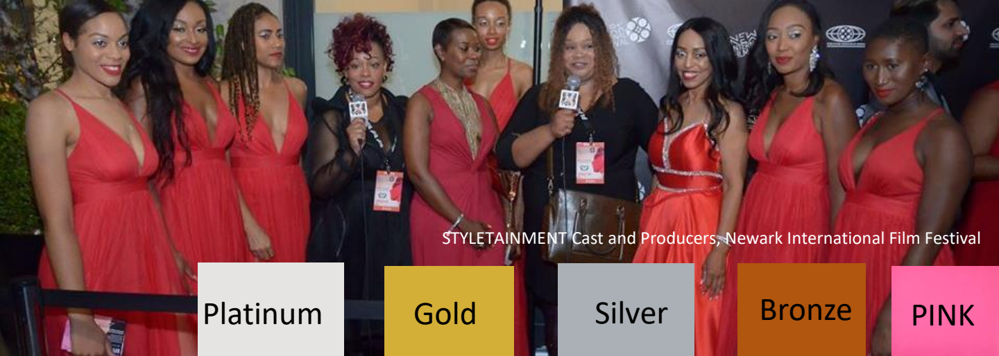
STYLETAINMENT Cast and Producers, Newark International Film Festival